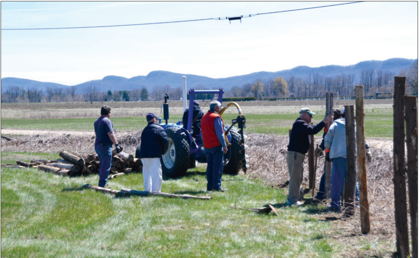
The crew setting new posts as part of this year's field clean-up.